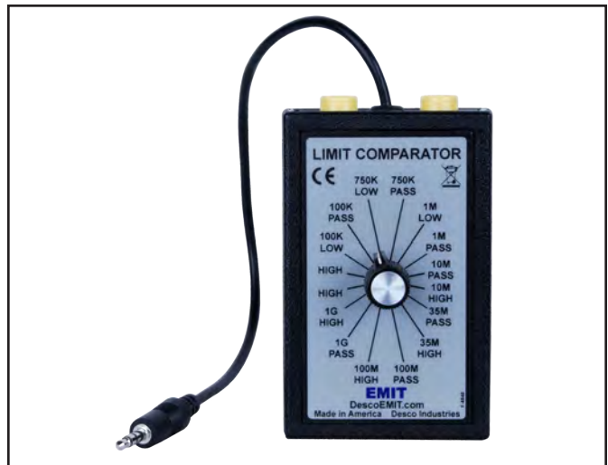
Figure 4. EMIT 50422 Limit Comparator

The EMIT Limit Comparator allows the customer to perform NIST traceable calibration on a number of EMIT Testers including the 50407, 50562, and 50413. The Limit Comparator can be used on the shop floor within a few minutes virtually eliminating downtime, verifying that the Dual Independent Footwear and Wrist Strap Tester is operating within tolerances.