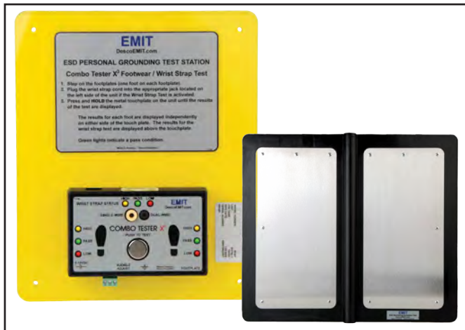
Figure 1. EMIT Dual Independent Footwear and Wrist Strap Tester and Dual Foot Plate